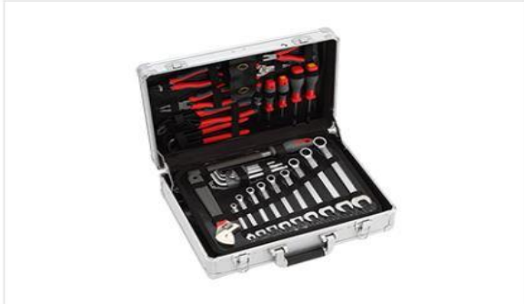
Category : Hand Tools Class : Tool Set